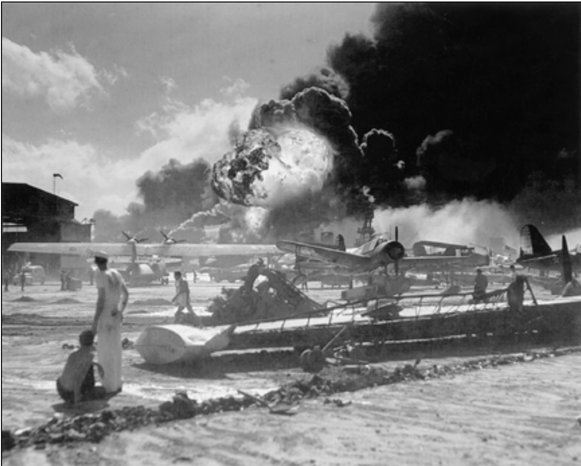
Sailors at Ford Island Naval Air Station watch the U.S.S. Shaw explode, December 7, 1941 Courtesy of the National Archives; War & Conflict # 1134

Study the photograph below for a few moments. First form a general idea about the events that the photograph depicts. Then, study each section to see what new details become visible.